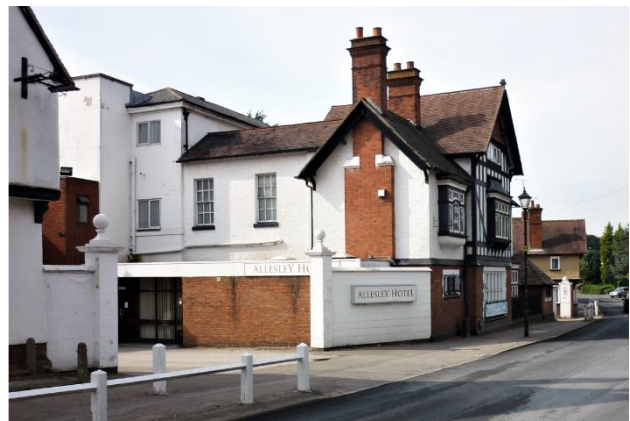
Figure 2. Allesley Hotel 2022