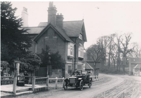
Figure 1. Allesley House c1900

Allesley Hotel. 73 Birmingham Road Coventry